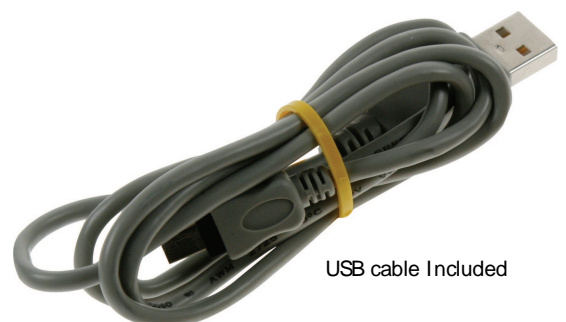
USB cable Included