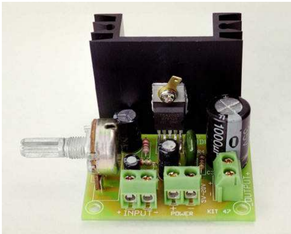
Photo showing optional power supply ground tag mounted on the I.C. (Note output capacitor is now 2200 \mu F)